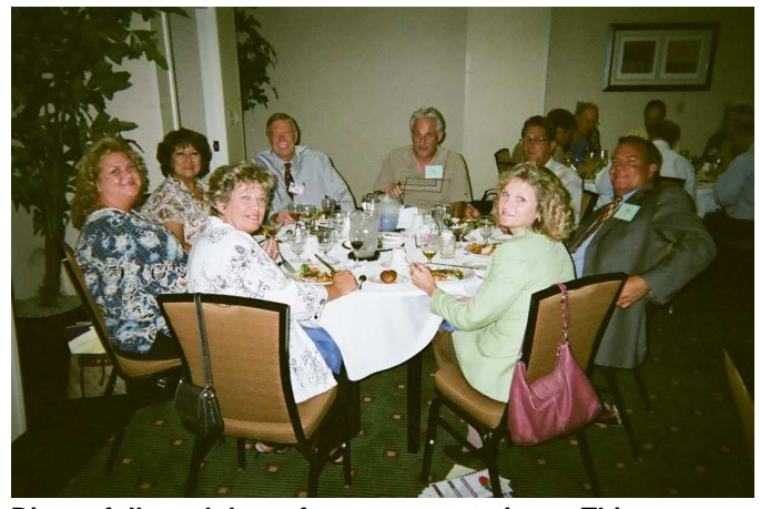
Dinner followed the software presentations. This was an ALL-REPS event and half of those attending were not ERA members, many of them are MANA members.