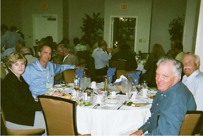
At dinner a good time was had by everyone as we renewed old acquaintances and made a bunch of new ones. Rep software is of interest to everyone.