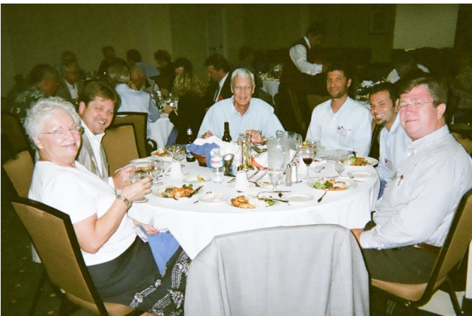
The software vendors sat throughout the room so everyone had a second chance to ask more questions. The vendors were only too happy to participate.