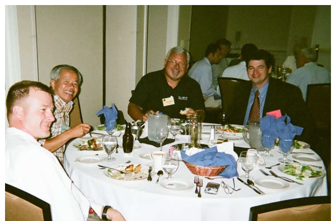
Everyone had a good time. Problem solving and conviviality are part of any rep gathering, particularly when they come from various industries.