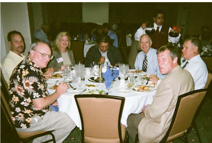
The conversation was lively, as it always is when a bunch of reps get together. Rep software seems to be of interest to firms of all sizes.