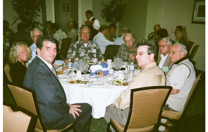
Members and non-members enjoyed each other and their differing points of view. Activities with other reps joining in have proved very rewarding.