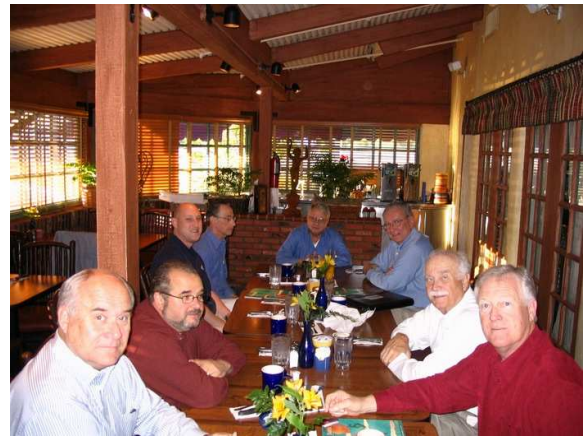
Orange County Breakfast in Tustin Mimi's