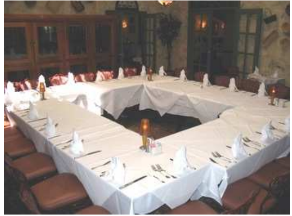
A typical Owner's Forum table for twenty-four.

An Electronics Industry Social Event August 6, 2009, Sagebrush Cantina at 4:30 23527 Calabasas Rd., Calabasas, 101-Valley Circle Everyone in the industry is invited - no reservations