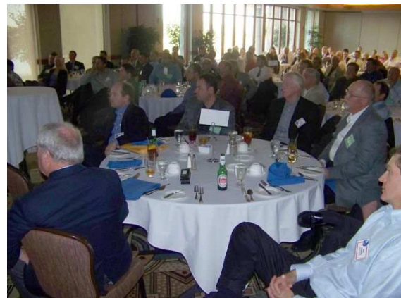
This was a highly informative and lively event with a crowd of 130 electronics industry attendees.