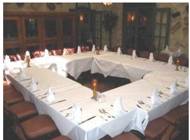
An Owner's Forum table set for twenty-four.