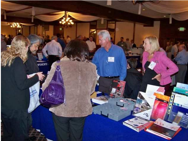
Proud Bird Show, March 3, 2010 More: www.erascal.org/ShowPhotos-10/2010PBShow.pdf