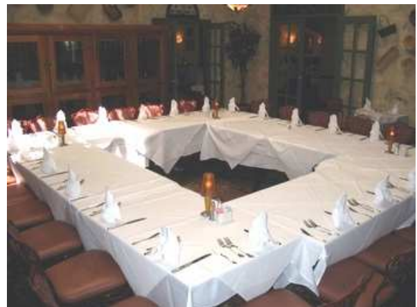
An Owner's Forum table set for twenty-four.

ERA Owner's Forums cover a wide range of rep business operations issues: leadership, company ownership, management, staffing, compensation, buy-sell agreements, disability, succession, dealing with principals and customers, commission issues, etc. These are lively sessions where some issues are "personalized" by participants and used to solve their own problem.